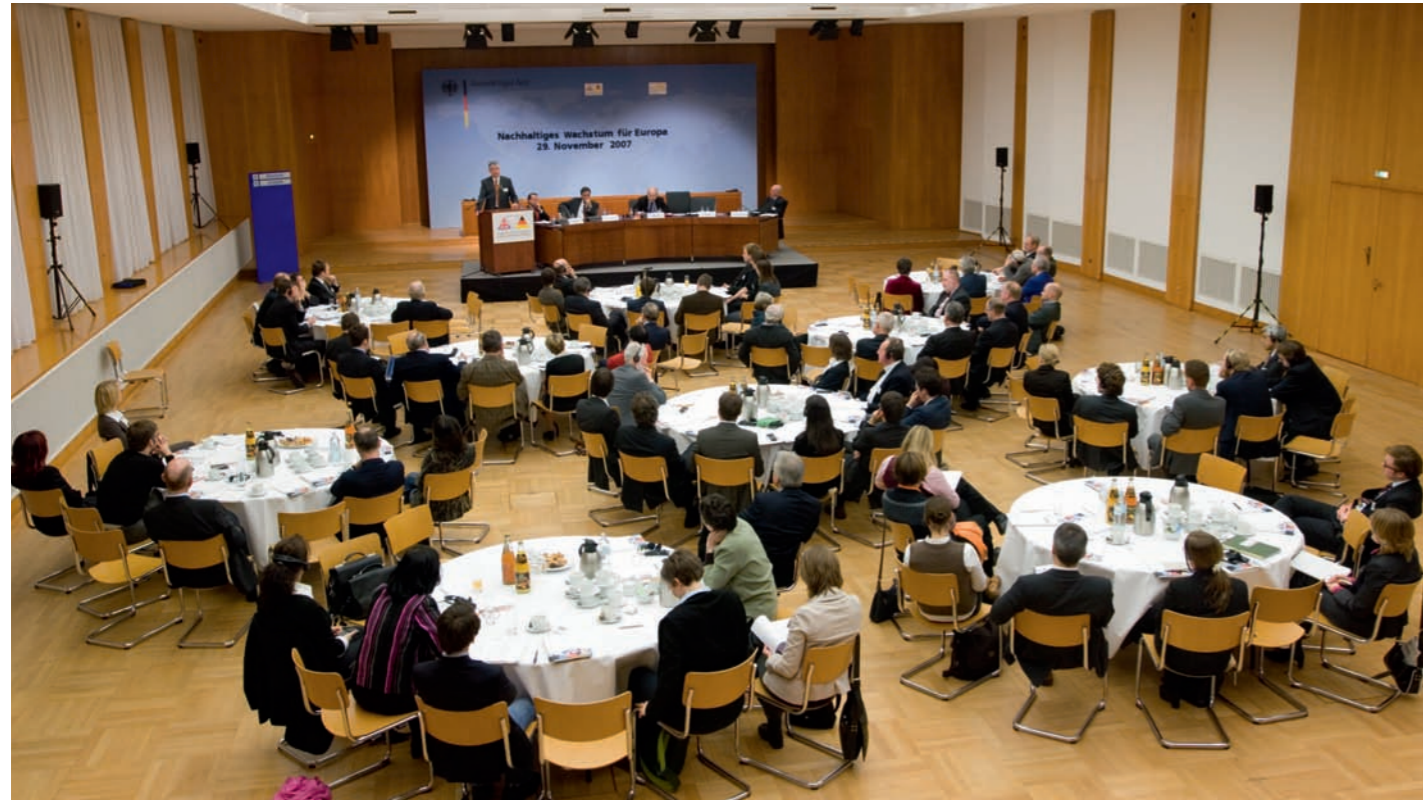
Europasaal, Auswärtiges Amt, Berlin

Our longer-established programmes also continued to generate valuable insights and bilateral exchange of ideas.